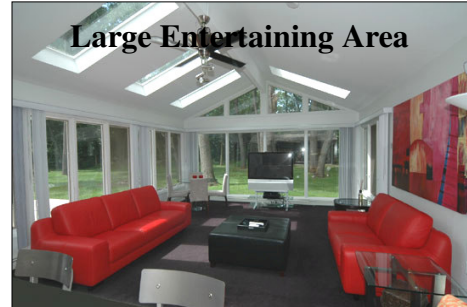
Large Entertaining Area

Contact Eva Morrow at 248-320-9100 for your private viewing!