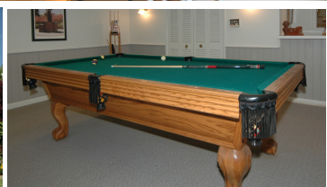
Custom Pool Table Included!